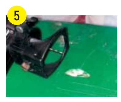
A rotozip or dremel can be used to remove the damaged fiberglass.