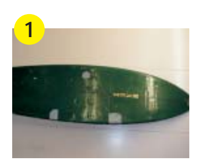
This surfboard has seen better days!