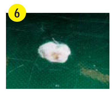
After the damaged fiberglass is removed, make sure the foam core is perfectly dry. Remove damaged or crushed foam.