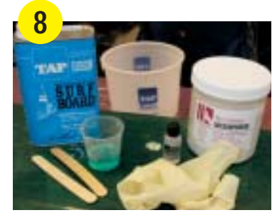
Assemble the materials you will need – mix Microspheres and Surfboard Resin to make a resin foam to fill the hole.