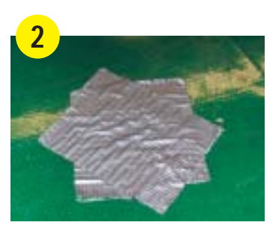
Duct tape may work in an emergency. But it is ugly and water can still leak into the foam core of the board.