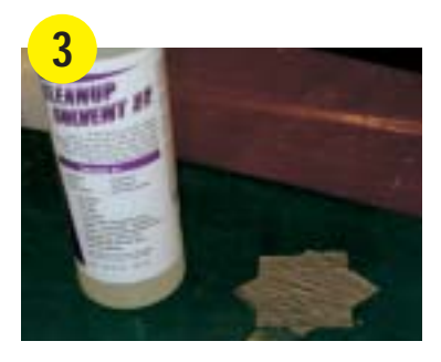
Removing the duct tape can be the first challenge. Use CleanUp Solvent 22 for easy adhesive removal.