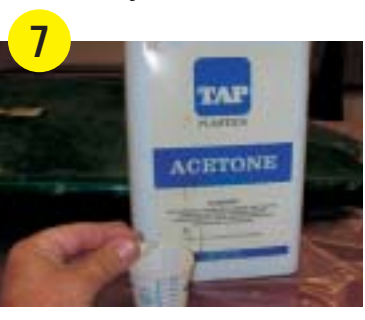
Remove a piece of the foam core and place in Acetone. If nothing happens, use Surfboard Resin for repair. If foam dissolves, use epoxy.