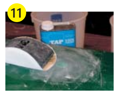
Once cured, sand smooth with successive or its of sandpaper.